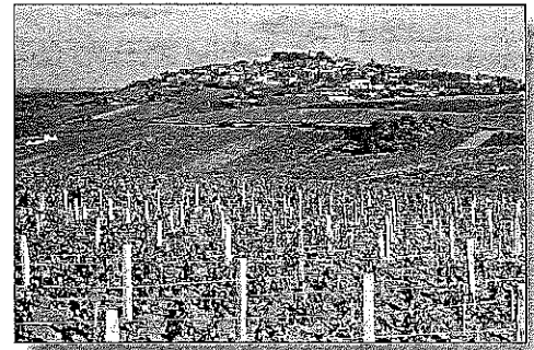
Vineyards Near Chavignol, France

The people of France are some of the most ethnically diverse on Earth. Immigrants from former colonies and possessions in Africa, the Americas, and Asia have settled in France over the last century. More recently, refugees from war-torn areas of the Middle East, Africa, and central and eastern Europe have been allowed into the country. While this creates new pressure on France's resources, it continues the age-old tradition of cultures coming together to produce new trends in art, literature, music, fashion, and food. This has made France a world leader in culture.